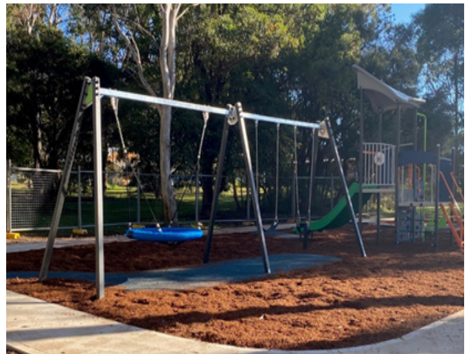
New playground at Aliceton Reserve

We'll update our project page and continue to update the community in the coming months as works are planned.