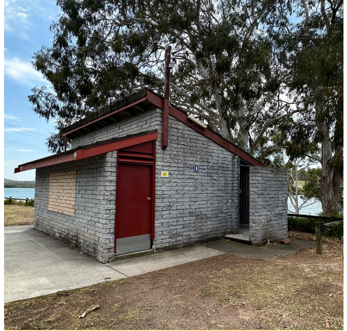
Current amenities at Memorial Park

Following further investigations and feedback received during community engagement earlier this year we are pleased to advise that the Amenities will stay and the planned demolition of the public amenities deferred indefinitely.